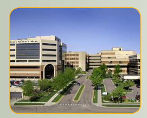
Avera McKennan Hospital

Avera Health Systems – Avera McKennan Hospital and University Health Center Summit Express Connect Interface Engine